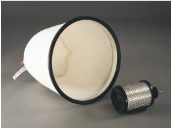
Extra filtration options