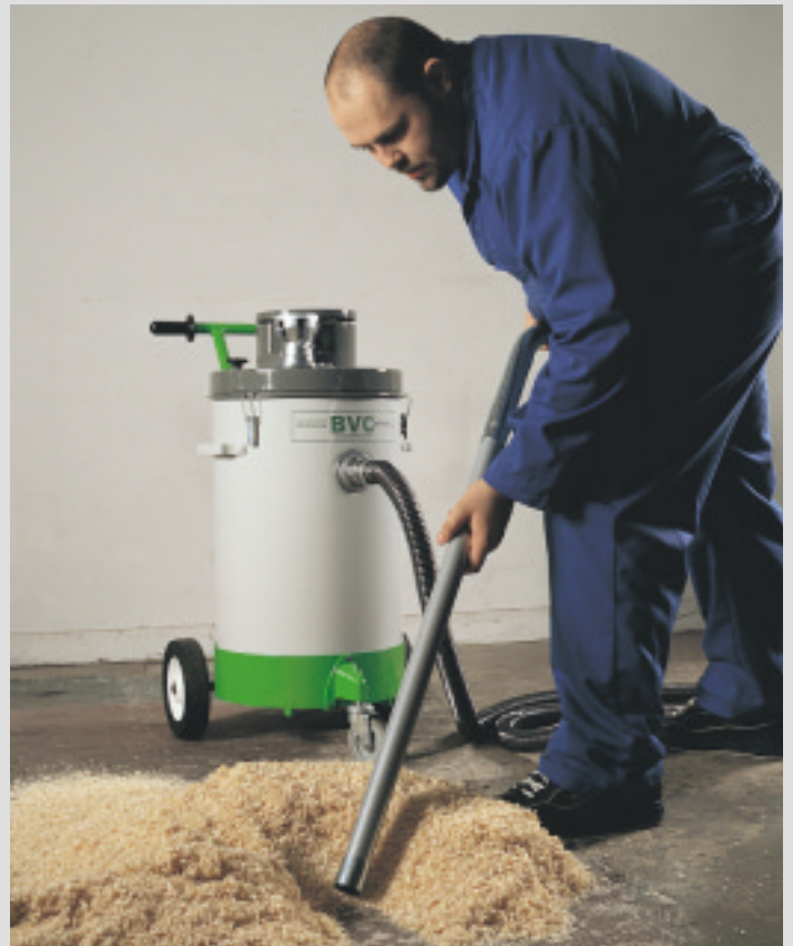
Bulk spillage collection