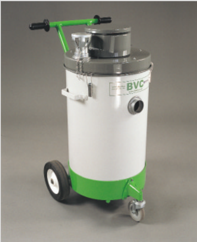
IV40 Indy on trolley